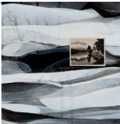
1 'Transplanted', oil on canvas 2016 2 'Allison: He Poroporoaki', oil on canvas 2016 3. Untitled: 30cm x 30cm, Ink on ply, 2017 4. Country: A Place of Hope, 120cm x 120cm, oil and ink on canvas, 2017 Inaugural Royal Art Landscape Award , 2017 5. Tree of Life: Tihei Mauri Ora, 150cm x 125cm, oil and ink on canvas, 2016, Minnawara Award Finalist 6. Taranaki: A Place to Remember, 150cm x 125cm, oil on canvas, 2016, Minnawarra Art Award Finalist 7. Loch Katrine: 30cm x 30cm, oil and ink on ply with B/W Photograph, 2017